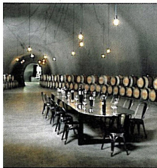
The low-impact CADE winery in California