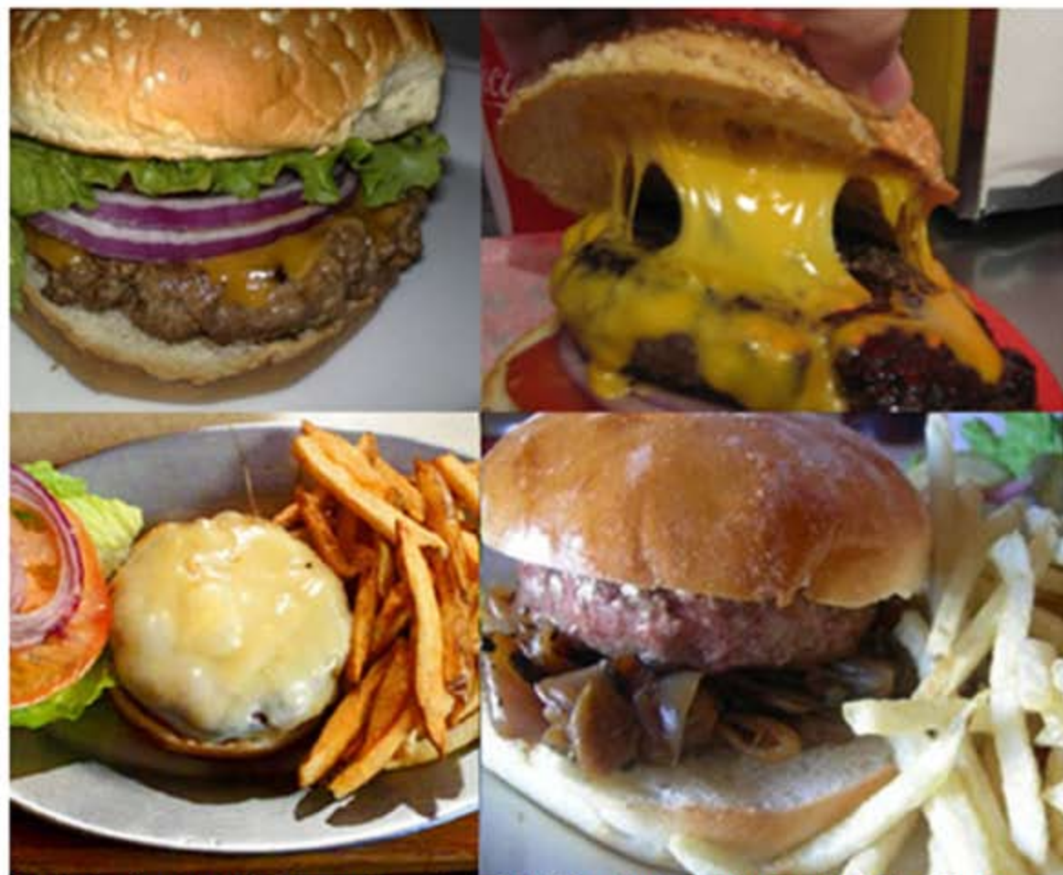
Clockwise from top left: Burgers from Joe's Cable Car (photo credit), Pearl's Deluxe Burger (photo credit), Balboa Cafe (photo credit) and BullsHead (photo credit).