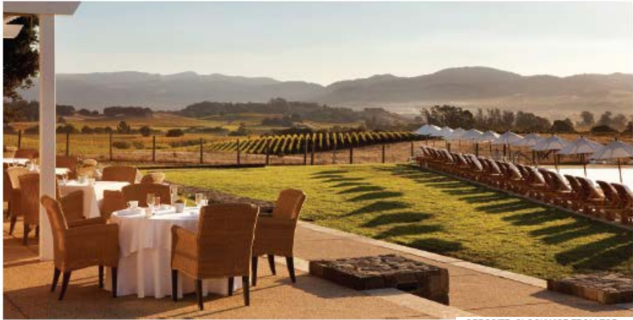
OPPOSITE, CLOCKWISE FROM TOP: The Vineyard at Domaine Carneros, Private Dining at Meadowood Restaurant, Wine Tasting at Vineyard 29 and The Tanks at CADE Winery.